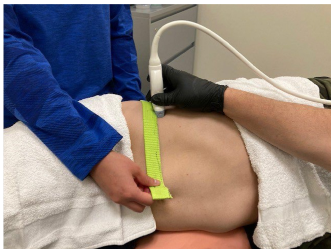
Figure 1 Participant positioning and probe guide during ultrasound imaging.

A cross-sectional study at a university laboratory was conducted. Data collection spanned 2019 to 2021 and included 12 hypermobile participants and 12 sex-matched, height-matched, weight-matched and age-matched non-hypermobile participants in line with established recommendations for sample sizes in exploratory studies. 13