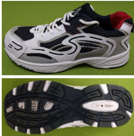
Figure 1 Side and sole view of the Ascot neutral running shoe.

After a 3-min rest period, subjects were given the standardised verbal instruction ‘we would now like you to run in a light, soft and quiet way’. This was in accordance with suggestions by the distributor and similar to those used in the study by Diebal et al 27 to encourage a FFS. Subjects ran for another 2 min attempting to follow the instructions, which were repeated after one and 2 min. Thereafter, data were recorded for 20 s.