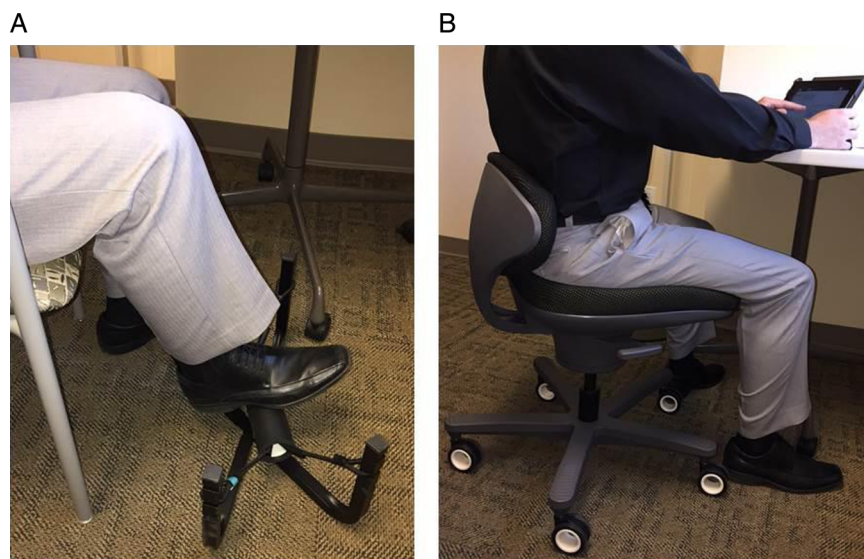
Figure 1 (A) FootFidget, http://footfidget.com , and (B) CoreChair, https://www.corechair.com .