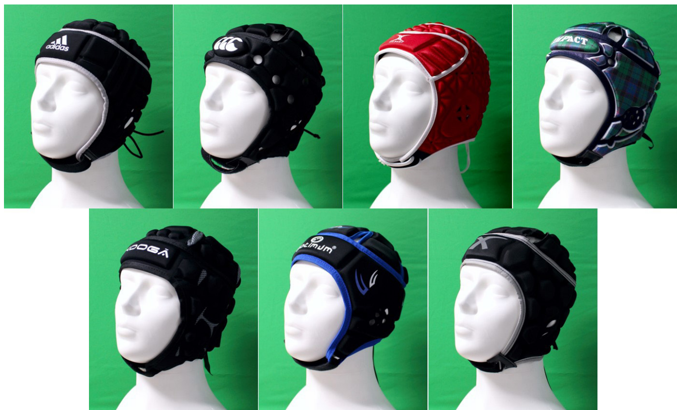
Figure 1 Headguards selected for testing (left to right): Adidas Rugby headguard (£34.95), Canterbury Ventilator headguard (£42.00), Gilbert Evolution headguard (£34.99), Impact RWC Tartan headguard (£39.99), Kooga Combat headguard (£28.99), Optimum Hedweb Classic headguard (£24.99) and XBlades Elite headguard (£34.99).